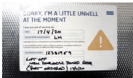
Sick joke in Birnies Court

block's top floor says, 'When both lifts are down I'm trapped in the flat. As simple as that. It's like doing time for a crime I didn't commit.'