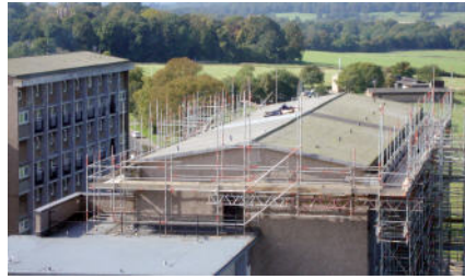
Inchmickery: Flat Roof, Apex Roof

The scaffolding has been taken down and Inchmickery Court's roof is now officially completed.. It's a pity they didn't fix the leaks when they were up there . . .