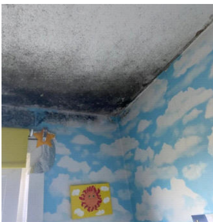
Black mould in the four-year-old's bedroom

The young mum said she is hoping to move council house but has been told her case 'is not a priority.' 'It's so difficult when I have had officials come round, look at the mould which is just disgusting, and still not treat our situation as important. I have two little boys and look at the state of their room.'